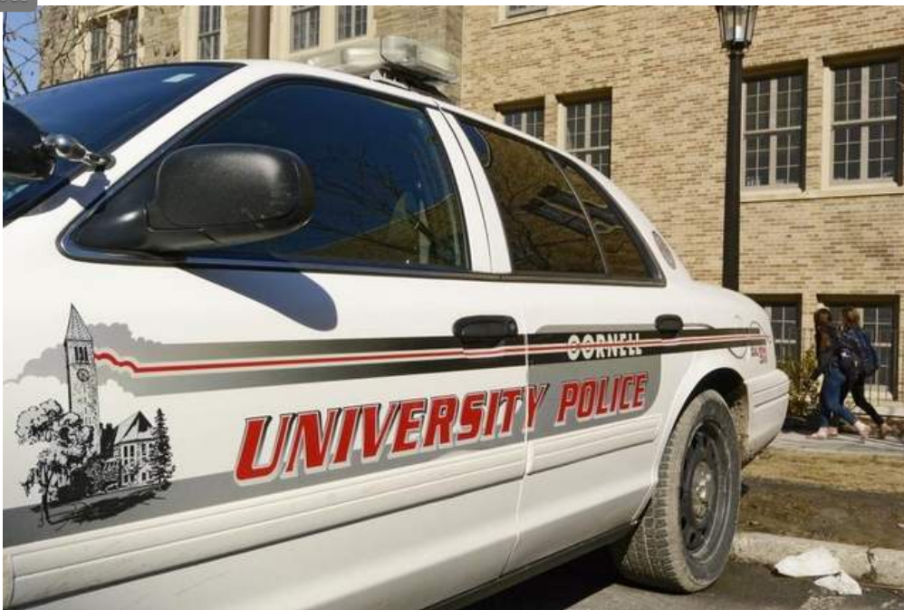
Cornell University Police post their activity log on their website.